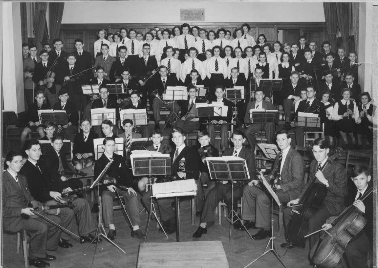
"Herald" Photo 6541