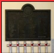
WW1 72 DEAD