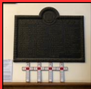
WW2 62 DEAD