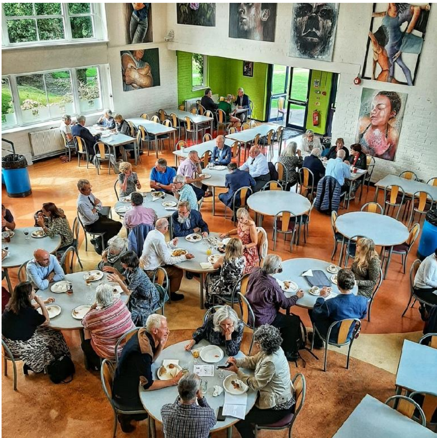
A convivial 50 th birthday event enjoyed by all as shown by this snap of the dining area at The College.

This link above shows the programme for the event, this includes roll calls for boys and girls, the order of events, RIP and thanks. An insert included the words for “Jerusalem” and the FGS School Song.