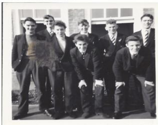
A happy band of brothers outside Room 'B' in 1959.