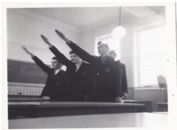
Long before the words 'political' and 'correctness' became conjoined, we would greet the new day by saluting the assembled past headmasters of FGS whose pictures adorned the walls of Room 'B'.

The year is 1959. The place is Farnham Grammar School.